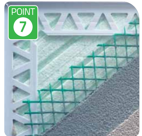
E.P.S Polymer Modified Render ▪ 1st Coat + Fibreglass Mesh