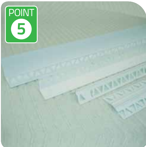
UV Stabilised P.V.C Beading