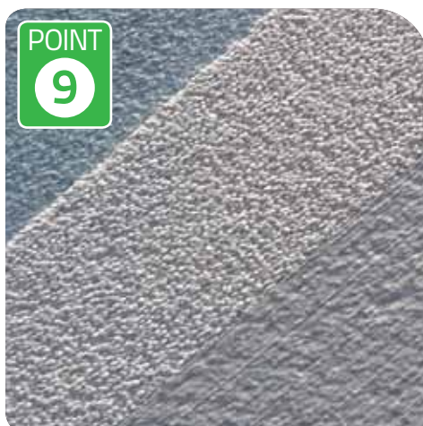
Final Acrylic Texture Coat ▪ Trowel On