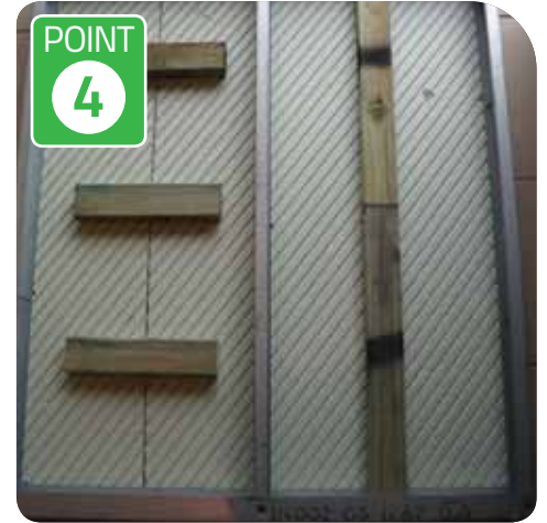
Backblock Off Stud Joints