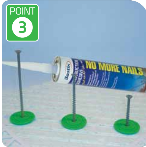
Mechanical Screw Fix + Glue