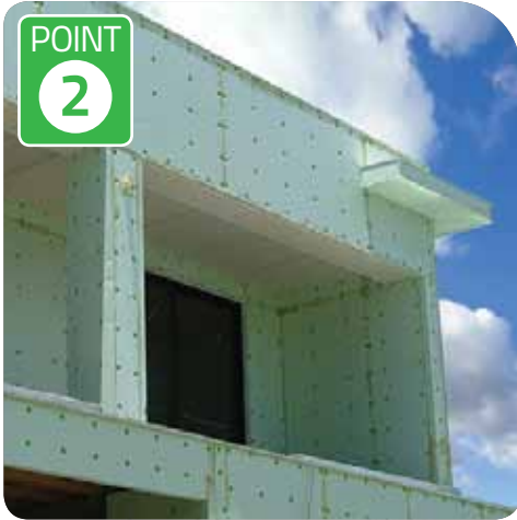
Measure + Cut + Position