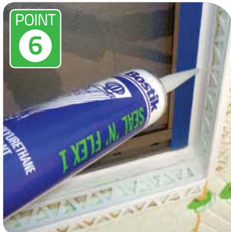
Polyurethane Joint Seals